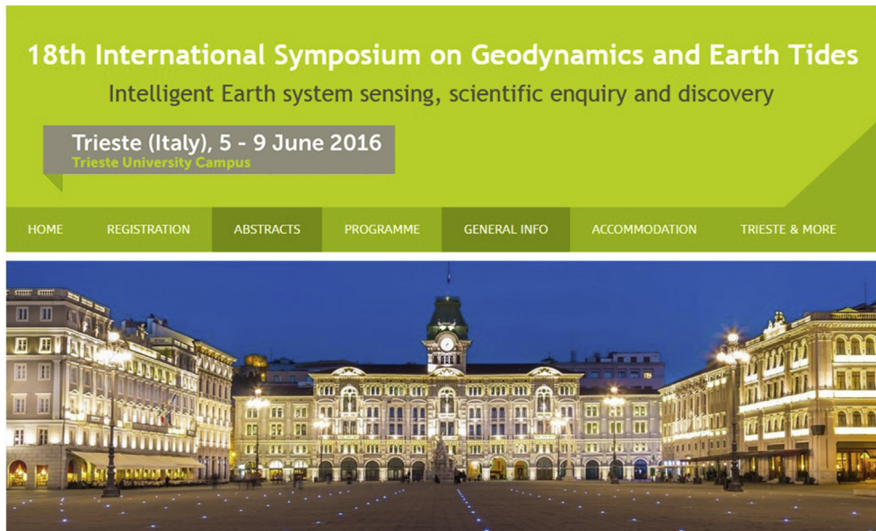
Fig. 1. Opening page of the Home Page of the Symposium ( https://g-et2016.units.it/ ).

The Topical Volume published in Pure and Applied Geophysics opens with two studies on the Earth's core resonance at diurnal periods, with Agnew [11] finding that the resonance can be seen in ocean tidal gauge records, and Bán et al. [12] discussing its observation in quartz tube extensometers. A theoretical paper on the deformation of the Earth in response to tidal forces, for analyzing rheologic properties is given by Varga et al. [13]. Another theoretical paper addresses the earthquake triggering effect of Earth tides (Varga and Grafarend [14]).