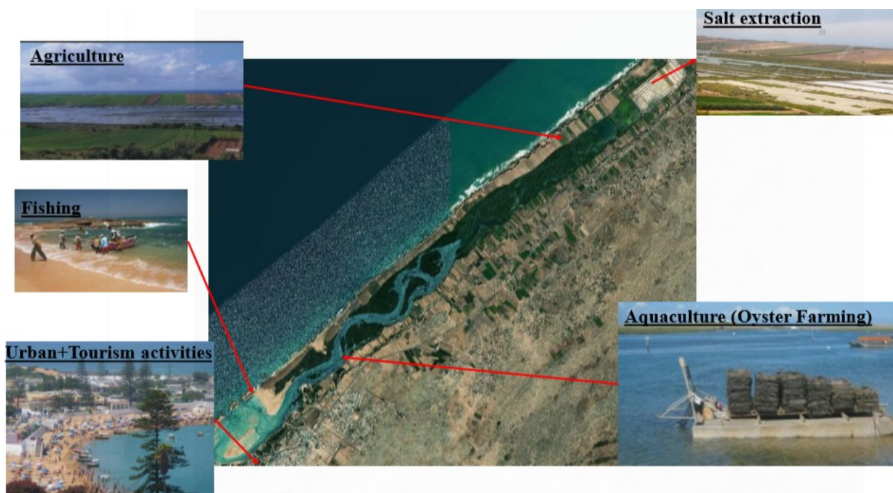
Fig. 3. The main human activities in the Oualidia lagoon