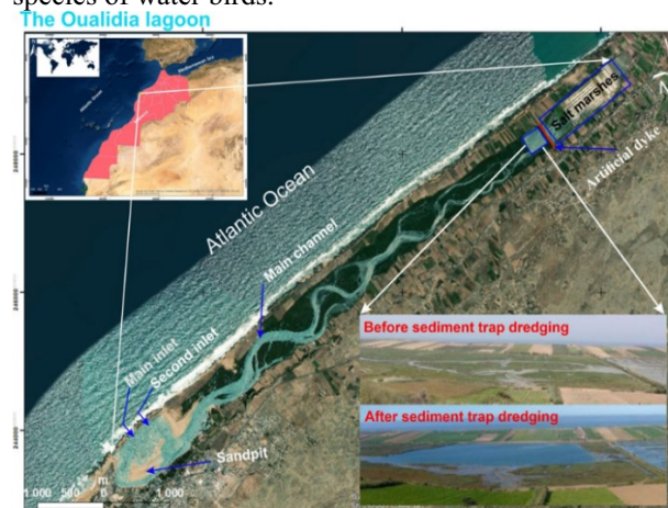
Fig. 1. The geographic location of the Study area

This lagoon is among the most important coastal wetlands in Morocco. Today, in relation to its ornithological importance, this site has been classified as a site of biological and ecological interest (SIBE), through the Master Plan of Protected Areas and as a RAMSAR site since 2005. Of international value constitutes a migratory stopover and a winter refuge appreciated by the various species of water birds.