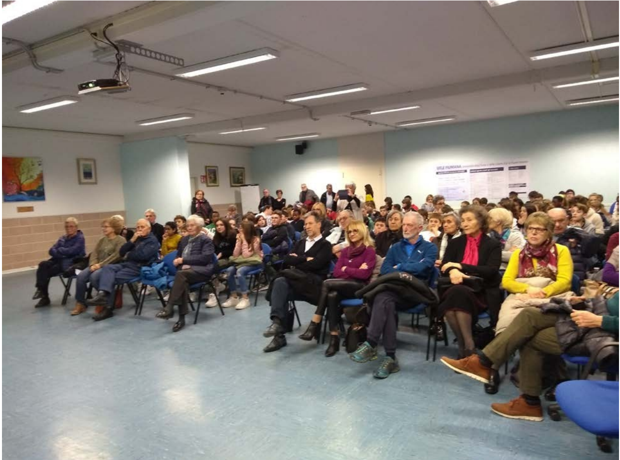
Figure 5 Photo