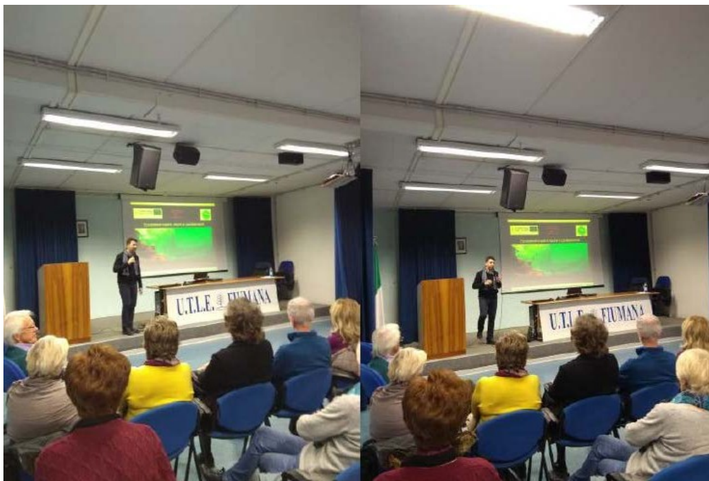
Figure 4 Photo

LP-OGS presented FAIRSEA project at a public event organized at UTLE Fiumana in Fiume Veneto on 6th February 2020. One presentation to five classrooms was presented to of a secondary school and university of the third age