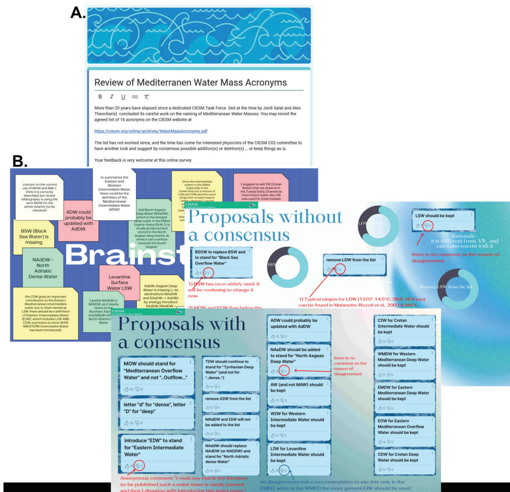
Fig. 1: (A) Screenshot of the header of the online questionnaire which was initially used to identify expert opinions on Mediterranean water mass acronyms (B) Screenshots of the online tool used to brainstorm and lead the discussion about different proposals on acronyms and definitions to find a consensus. Discussion focused specifically on items where no initial consensus was identified, to reach to a final list of fully consensual revisions.

This study employed a multi-pronged approach to revise and update the catalogue of acronyms for Mediterranean water masses. Firstly, an extensive literature review analyzed existing knowledge on the characteristics, distribution, and nomenclature of these water masses. This comprehensive review provided a foundation for understanding the current state of knowledge. Secondly, a group of experts in Mediterranean oceanography were consulted. An initial questionnaire (Fig. 1A) gauged their perspectives on the need for revision and gathered suggestions for improvement. Following this, consensus-building meetings (Fig. 1B) facilitated open discussions and ultimately led to the formulation of agreed-upon acronyms.